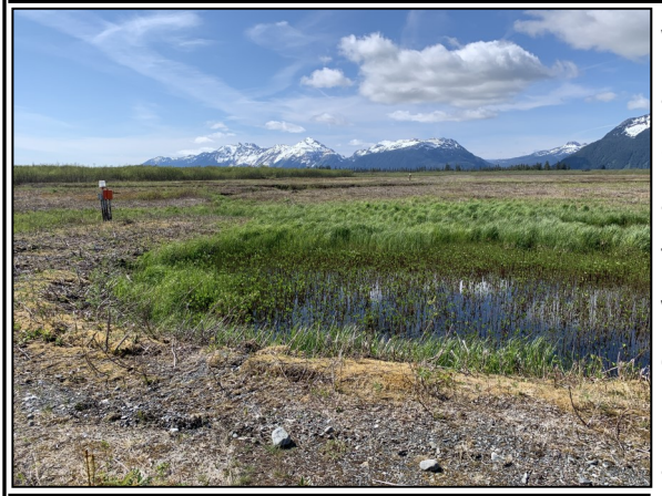
Figure 1: Looking west off the end of the runway towards Cordova

We had a site visit back in May to investigate replacing the airport lighting and navigational aids at Merle K. "Mudhole" Smith Airport in Cordova. Mudhole is a fitting name for the airport given that it is completely surrounded by wetlands, and at times, the runway lights are actually below the water creating